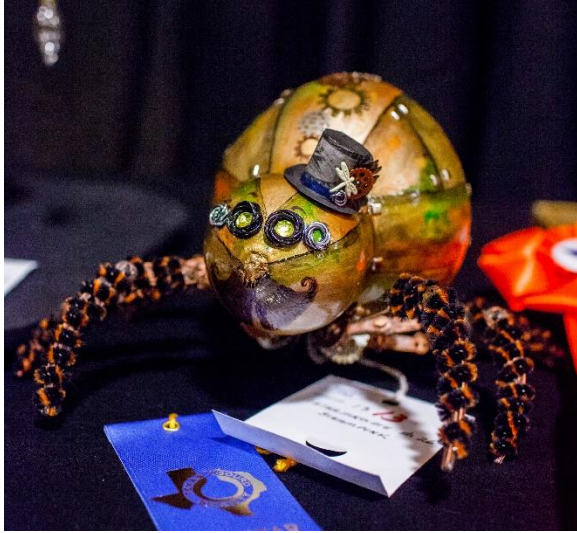
Best of Intermediate Division DeAnna White - Fantasy