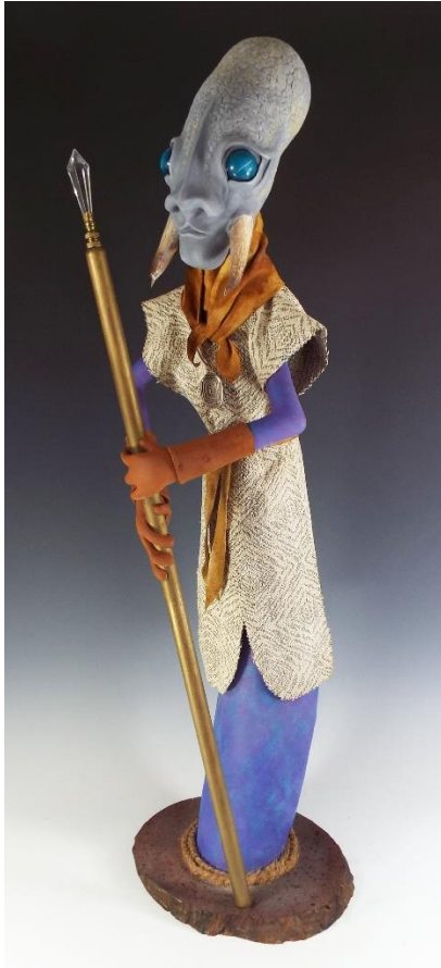
1 st Place - Judy Richie

What a fun category this was for both the Youth and Adults. We had four tables full of these visitors from Outer Space