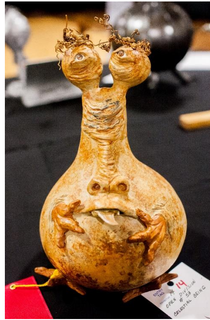
2 nd Place - Lynda Smith