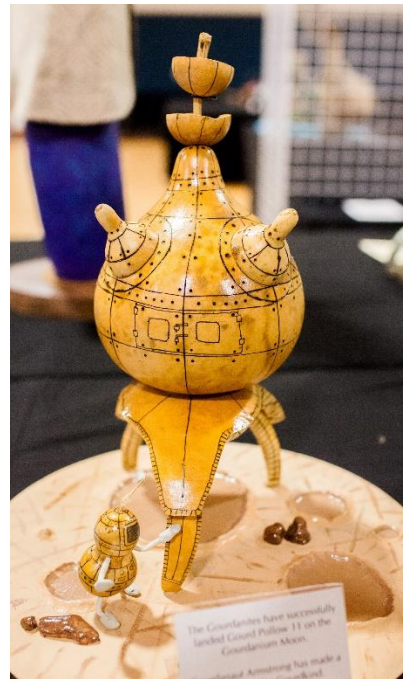
3 rd Place - Clifford Turner