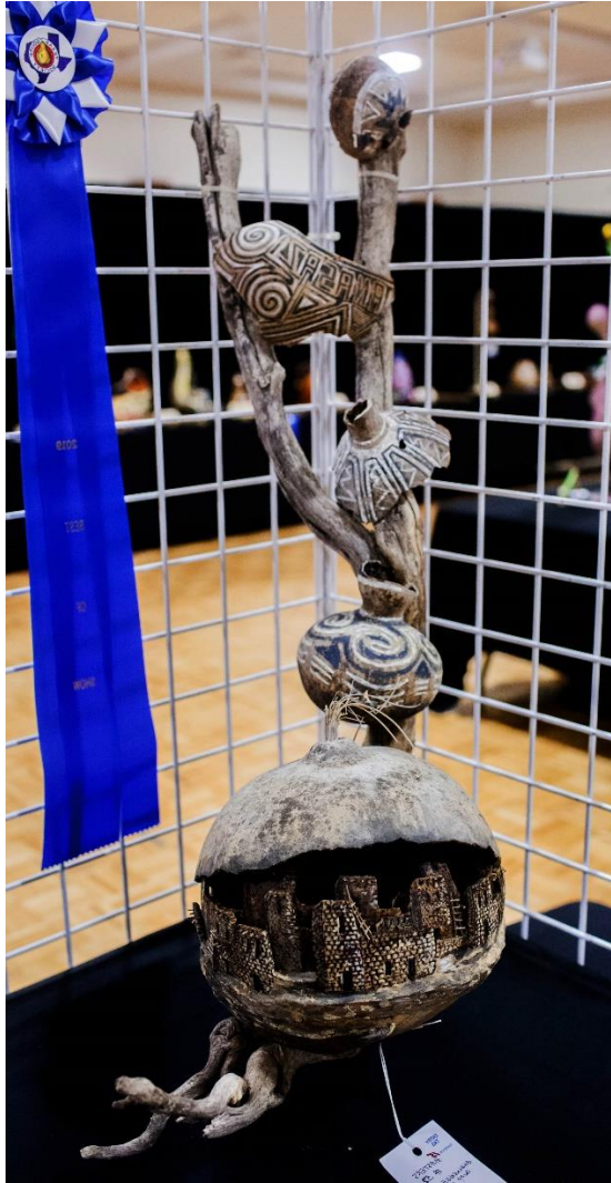
Best of Show

Best of Show and the Texas Award were chosen before the rest of the judging.