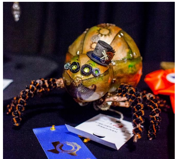
Deanna White - Intermediate, Steampunk