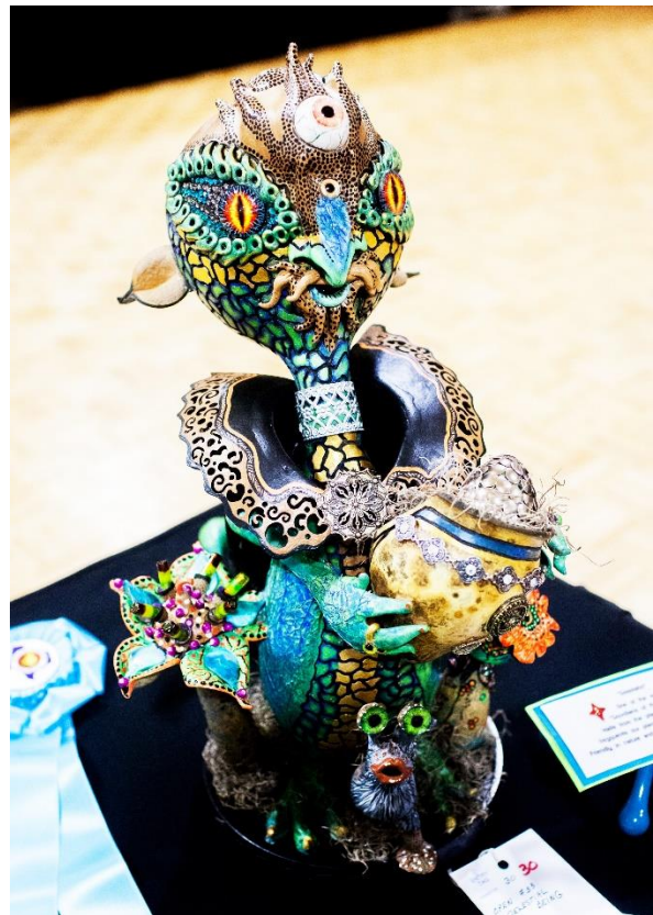
Texas Award (2 nd to BOS)